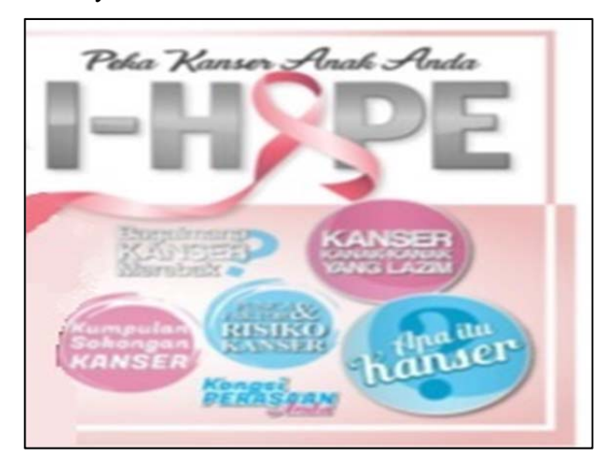
Figure 2. Main page of i-Hope website

Figure 2 shows the i-Hope website's main interface, consisting of four main modules and two support modules. All six modules use interaction design and infographics as the method of information delivery.