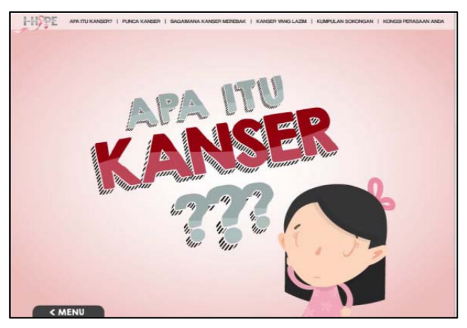
Figure 4. Infographic in Cancer Information Module

Figure 4 shows the infographic in cancer information module. The language is in Malay as shown on the page which in English means – What is Cancer? The page will explain in detail the definition of cancer and how cancer can happen. The information is given in graphics and text to support the same message.