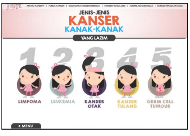
Figure 5. Infographic in Common Children Cancer Module

Figure 5 shows the infographic in the common children's cancer module. There are five types of cancer to choose from for further info. Once clicked, the infographics of related cancer will appear.