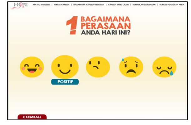
Figure 6. Infographic in Share Your Feeling Module

Figure 5 shows the infographic in the common children's cancer module. There are five types of cancer to choose from for further info. Once clicked, the infographics of related cancer will appear.